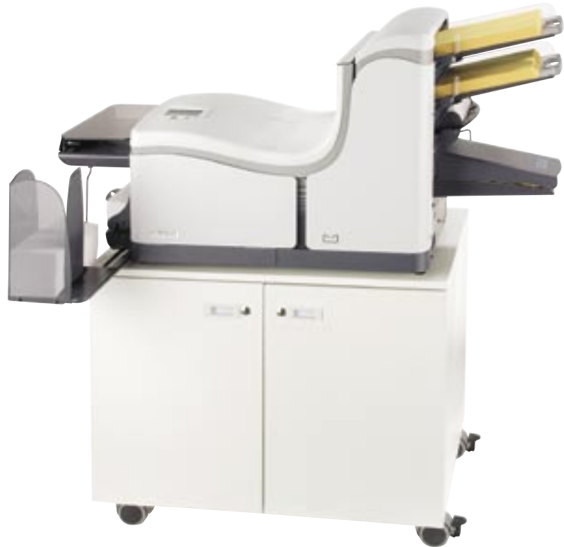
Shown with optional Side Exit Tray and Cabinet