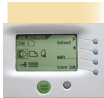
User friendly control panel

* All paper & envelope specifications may vary. All media must be tested.