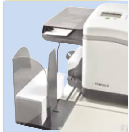
Side Exit Tray