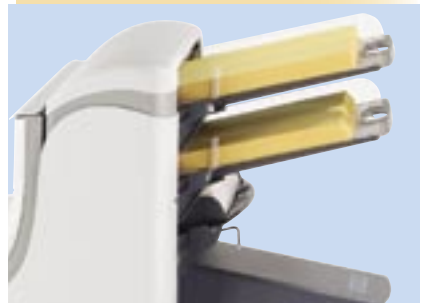
2 sheet feeders and 1 insert/BRE feeder