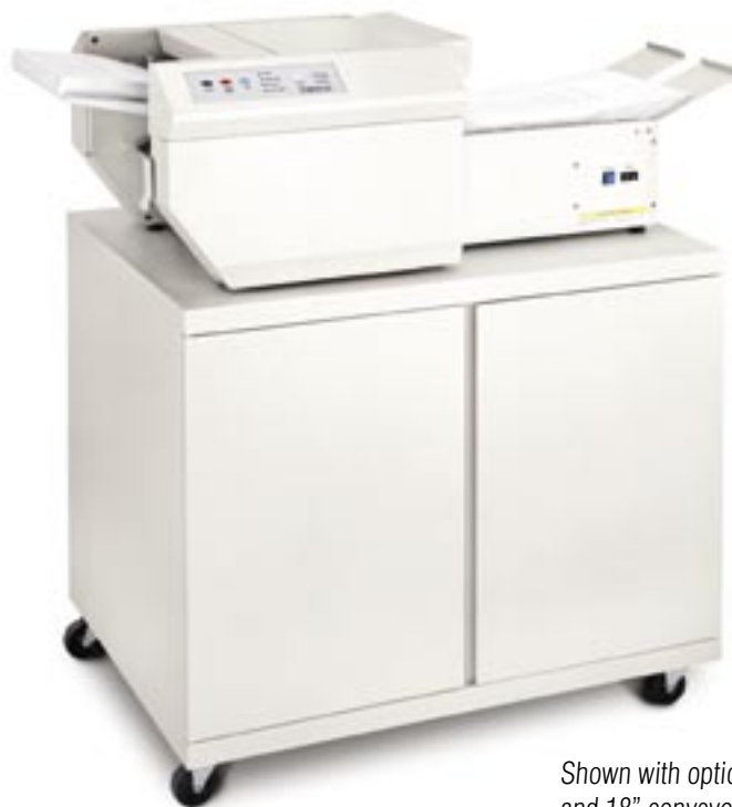
Shown with optional cabinet and 18" conveyor

The AutoSeal® FD 2000 folder/sealer is a powerful desktop model designed to process your pressure sensitive self-mailers. An easy to use touch-pad control panel and three roller feed system makes this product both practical and dependable. Up to 150 forms can be loaded in the hopper and processed at speeds up to 7,000 per hour. The FD 2000 also comes with an optional fully enclosed cabinet for storage and a conveyor with photo-eye for neat and sequential stacking of processed forms.