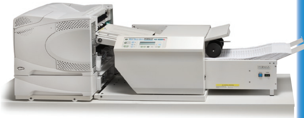
FD 2052IL System shown with IL Pressure Sealer and IL Alignment Base, laser printer (not included), optional conveyor and optional locking cabinets