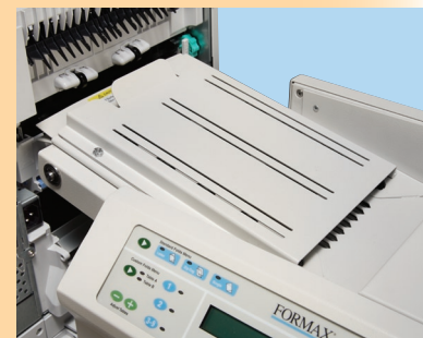
Enclosed paper path provides optimal document security