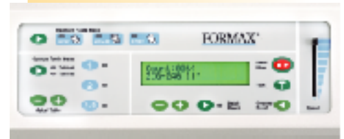
User Friendly Control panel

The P2052 processes forms at a rate of up to 11,000 sheets per hour and can hold up to 350 - 24# forms in the feed hopper. Combined with a duty cycle of up to 125,000 forms per month the P2052 offers the ultimate solution for streamlining your paper processing.