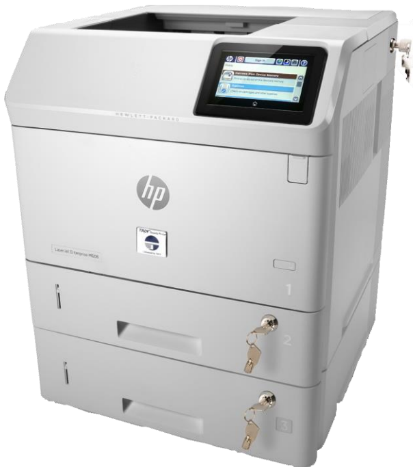
TROY M606 MICR Secure Ex printer shown with optional 2nd 500-sheet locking tray.